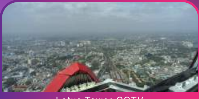
Lotus Tower CCTV