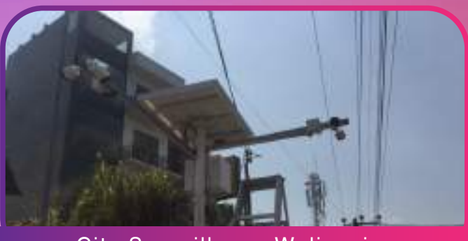
City Surveillance Weliweriya