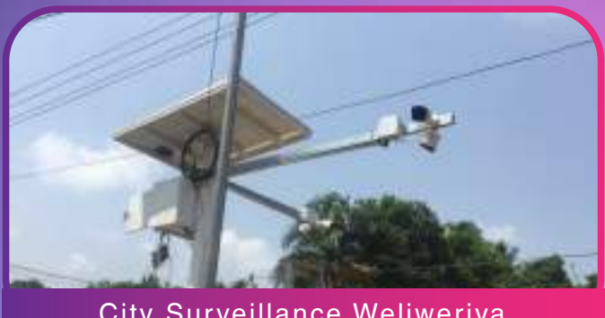
City Surveillance Weliweriya